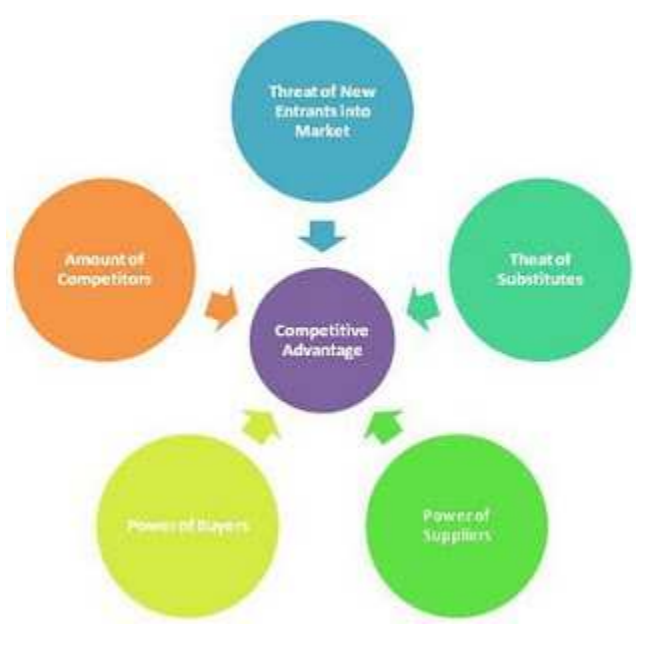
Figure 2: Porter's Five Forces Analysis (Krish, 2012)

Porter's model was designed and developed by Michael Porter in the 1980s to determine the competitive intensity and attractiveness of an industry (Spencer, 2015). In the case of M&S, the five forces that influence the industry are as follows: